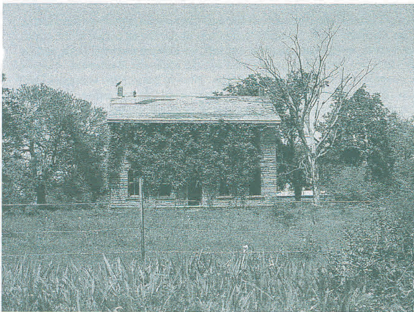
This 2007 photo of the same house May 16, 2007

It is possible that they had just arrived in the covered wagon shown in the photo.